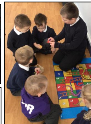
A selection of pictures including our visit from the Dental team, fun in the snow, our stay and read and stay and maths sessions and also some science investigations and artwork from our Adventure club.