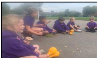
A selection of pictures including music, art, maths, our netballers and various other things from across the federation.