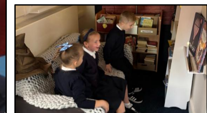
A selection of pictures including the Rawcliffe Bridge library, Tigers Trust, Science investigations, Yoga and maths.